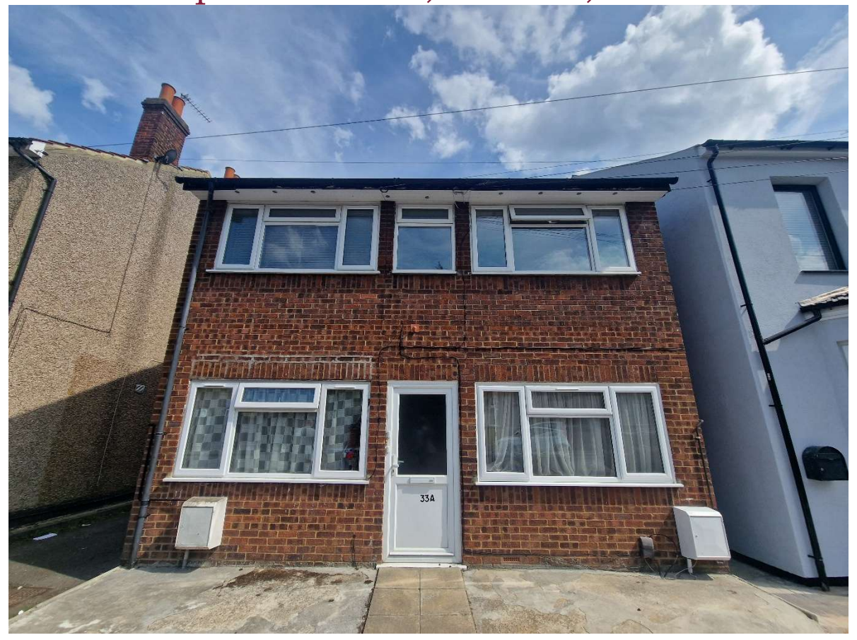
FOR SALE £350,000 Share Of Freehold

Major Estates Harrow LTD ~ 77 High Street, Wealdstone, Harrow, HA3 5DQ T: 020 8424 8686 ~ E: sales@majorestate.com ~ www.majorestate.com