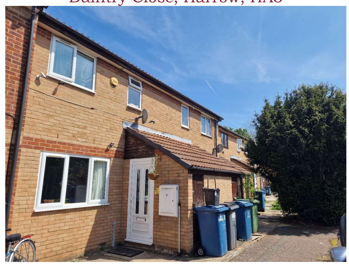
FOR SALE £525,000 Freehold

Major Estates Harrow LTD ~ 77 High Street, Wealdstone, Harrow, HA3 5DQ T: 020 8424 8686 ~ E: sales@majorestate.com ~ www.majorestate.com