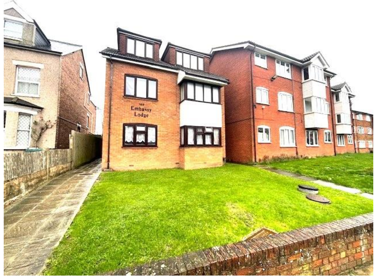
FOR SALE £289,950 Leasehold

Major Estates Harrow LTD ~ 77 High Street, Wealdstone, Harrow, HA3 5DQ T: 020 8424 8686 ~ E: sales@majorestate.com ~ www.majorestate.com