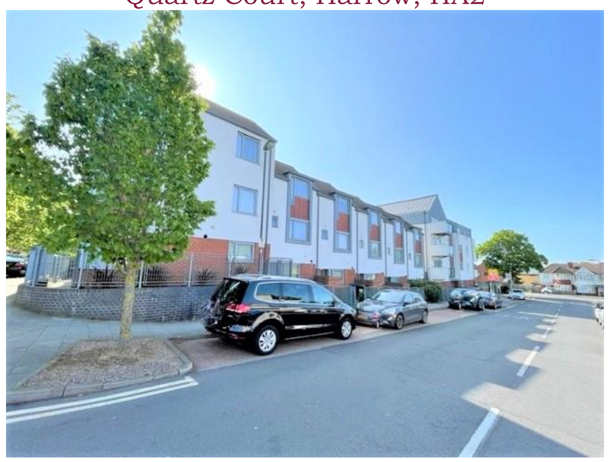
FOR SALE £300,000 Leasehold

Major Estates Harrow LTD ~ 77 High Street, Wealdstone, Harrow, HA3 5DQ T: 020 8424 8686 ~ E: sales@majorestate.com ~ www.majorestate.com